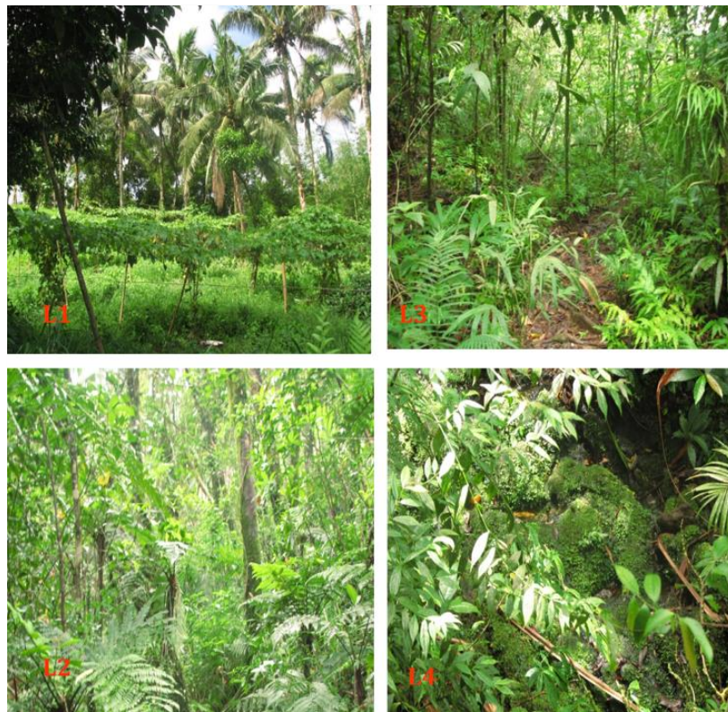
Figure 1A: Mt. Banahaw de Lucban trapping sites (1—Agricultural, 2—Secondary lowland, 3—Montane, and 4—Mossy forest)